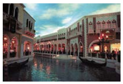
These Venetian canals at dusk were a great subject for Supra 400.

zooms, we switched to the ISO 400 film to give us more depth of field. Although the lighting was contrasty, both films provided bright whites and extreme shadow detail throughout.