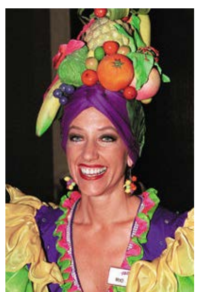
New Kodak Supra 400 captured the vivid colors of the fruit while retaining natural skin tones.

Text and Photos by Jack and Sue Drafahl, December, 2000