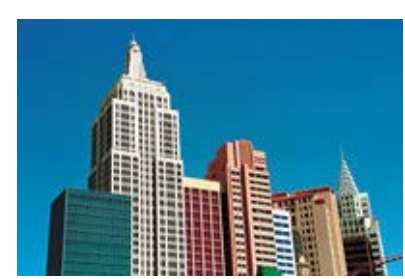
The middle member of the Supra family, Supra 400 is a great general-purpose film, providing excellent image quality and high

DIR, Universal DIR and DIAR Chemistries give great color saturation, even if underexposed. Supra 800 is able to capture precise detail with it new High-Efficiency T-Grain Emulsion. It too features fine grain because of Kodak's Advanced Development Accelerator and can even be pushed two stops, if necessary.