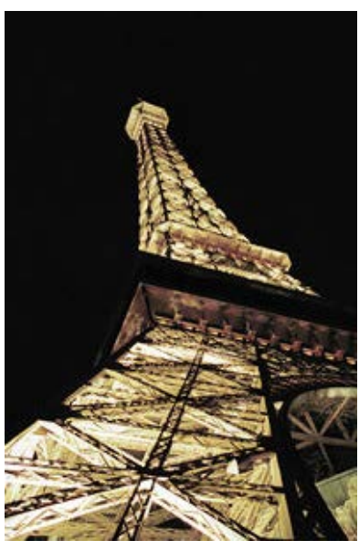
The fastest member of the new Supra film family, Supra 800 is a great low-light emulsion, with its combination of high speed and excellent image guality.