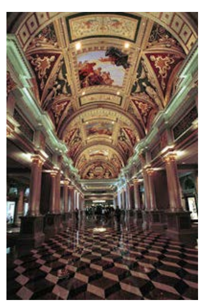
Supra 800's speed made this architectural interior shot a snap.

Well, we are now off to jolly ol' England. The British Isle holds its own special ambience as it is home to medieval castles complete with turrets, spires, bell towers and even a moat or two. We were even lucky enough to find a knight in shining armor willing to smile for us.