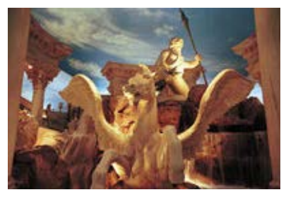
All three Supra films (this was on 400) have good exposure latitude and can hold detail in contrasty scenes very well.